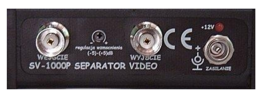
Views of the separator

SV-1000 is used as an extra security device in CCTV systems and protects CCTV equipment from the following: