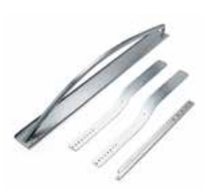
ARC 01 Swinging arm for overhead doors