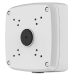
PFA121 Junction box